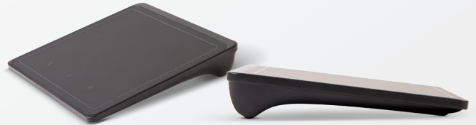
Lenovo® Wireless TouchPad (for non-touch models)