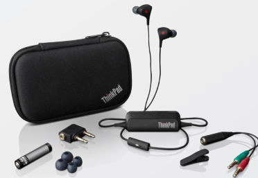
ThinkPad Noise-Cancelling Earbuds