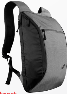
ThinkPad® Ultralight Backpack