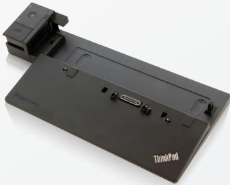
New ThinkPad docking for security, connection, and power