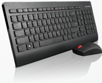
Lenovo® Ultraslim Wireless Keyboard and Mouse Combo (0A34032)