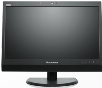
ThinkVision® LT2323z Monitor