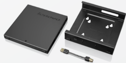
ThinkCentre® Tiny Storage Unit (0A65637)