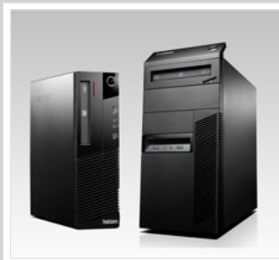
Small Form Factor Pro Expandability and functionality of a mini-Tower at just 50% of the size