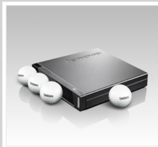
Tiny Form Factor Tiny is as compact as golf ball