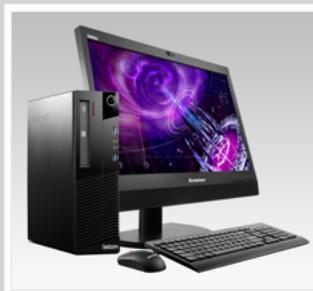
Graphic Experience life-like video quality with discrete graphics up to NVIDIA® Quadro® 410 4