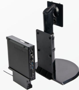
ThinkCentre® Tiny L-Bracket Mounting Kit (0B47096)