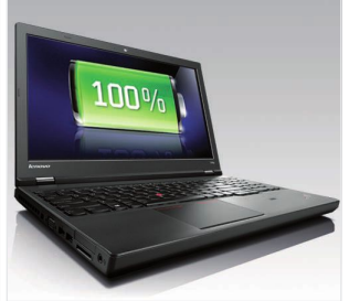
LONG-LASTING PERFORMANCE More than 13 hours of battery life on a single charge

The Lenovo® ThinkPad® T540p is the ultimate enterprise performer. Ready to handle any workload, the laptop offers 4<sup>th</sup> generation Intel® Core™ processors, up to 1TB storage, and 13+ hours of battery life. Bolster your working efficiency with the ThinkPad Precision keyboard and the larger trackpad that supports Windows 8 gestures. The stunning 15" display, available in 3K resolution, HD, or Full HD brings all of your applications to life.