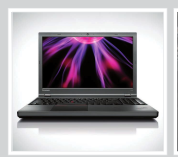
SUPERIOR CLARITY 15" HD, Full HD, and 3K resolution display options, for true-to-life visuals