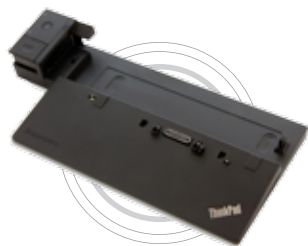
Ultra Dock Docking Station