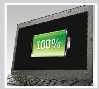
LONG-LASTING PERFORMANCE More than 10 hours of battery life