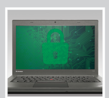
SIMPLIFIED USABILITY Intel® vPro™ makes security and management simple and easy