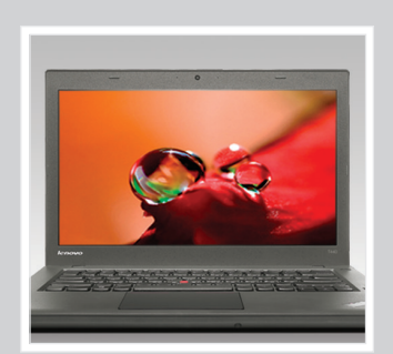
SUPERIOR DISPLAY 14" HD, HD+ screen with multitouch capability and Full HD display options, for clear and sharp visuals