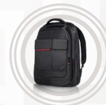
ThinkPad Professional Backpack