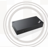
ThinkPad USB-C Dock