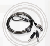
Microsaver DS Cable Lock