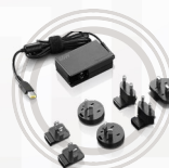
Lenovo 65W Travel AC Adapter